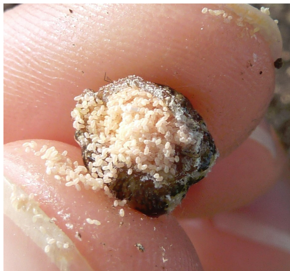
Pale pink calico scale eggs

If you have an infestation of calico scale, turn the adult females over to evaluate egg hatch. Eggs are first white and progressively change to pale pink then a dusty dark pink just before hatching. Crawlers are orange and about the same size as the eggs. If all you find is a mass of fluffy, white material , you’ve already missed crawler hatch. This material is the mass of egg shells left behind by crawlers. At that point, the majority of immature scales have probably already settled on the undersides of leaves where they spend the summer months. This is probably the second best stage to target because they are still very vulnerable to insecticides.