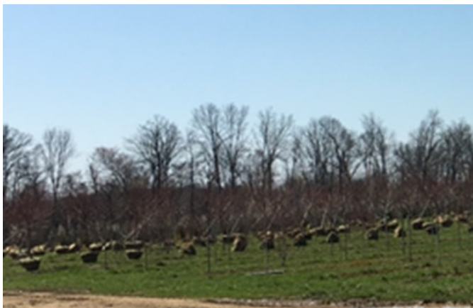
Balled and burlapped trees ready for pickup and shipping.