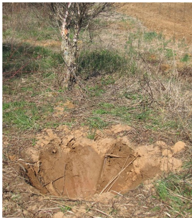
Individual hole after selective tree harvest