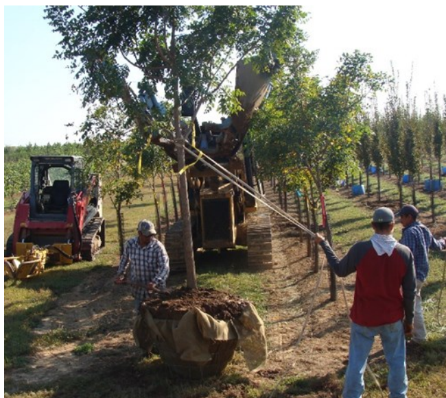
Balled and burlapped tree harvested in summer.

which are incorporated into the soil before the next cropping cycle. Green manure, cover crops sown in the soil while they are still green with no seeds, are commonly used in field nurseries. Green manure crops can be planted in summer or fall and plowed later in the fall or spring, respectively. Mowing is recommended to avoid seeding. The increase of soil organic matter is not