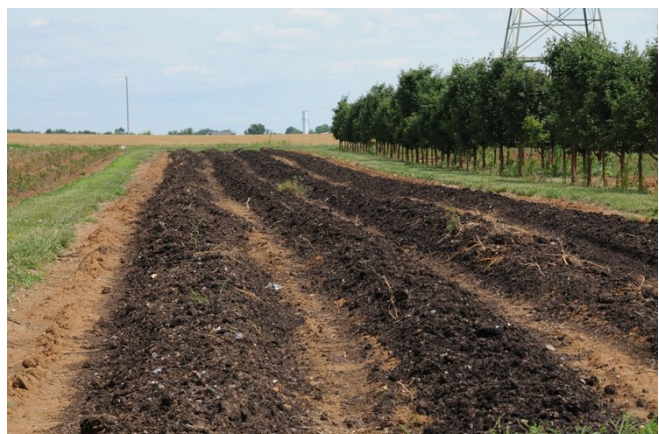
Land application of horse manure to rebuild topsoil in field nursery.