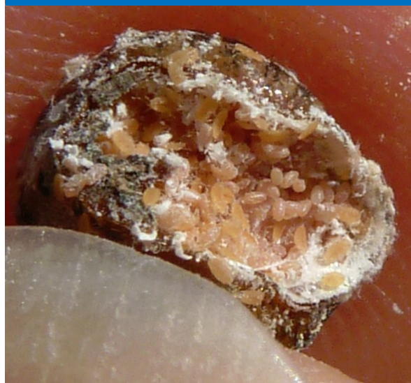
Dark pink calico scale eggs and newly hatched, orange crawlers