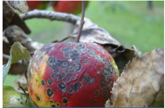
Figure 3. Older fruit lesions turn dark brown to black, develop a corky ("scabby") appearance and frequently become cracked as fruit enlarge.