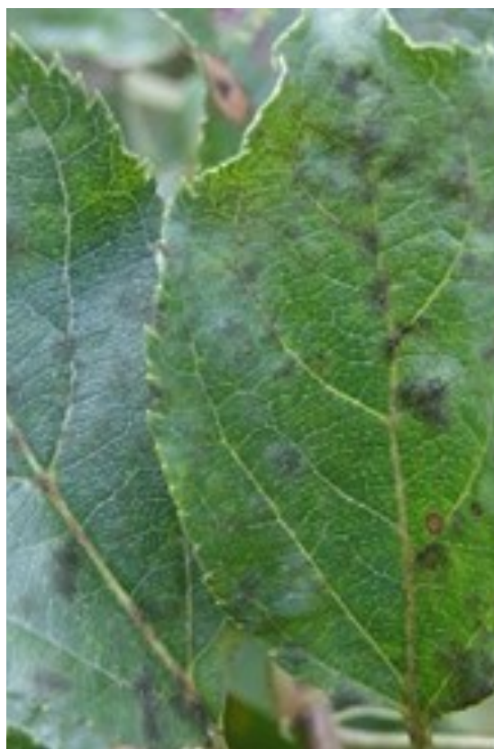
Figure 2. Older foliar lesions become more distinct, develop a greenish-black, velvety growth, and then thicken and bulge up.