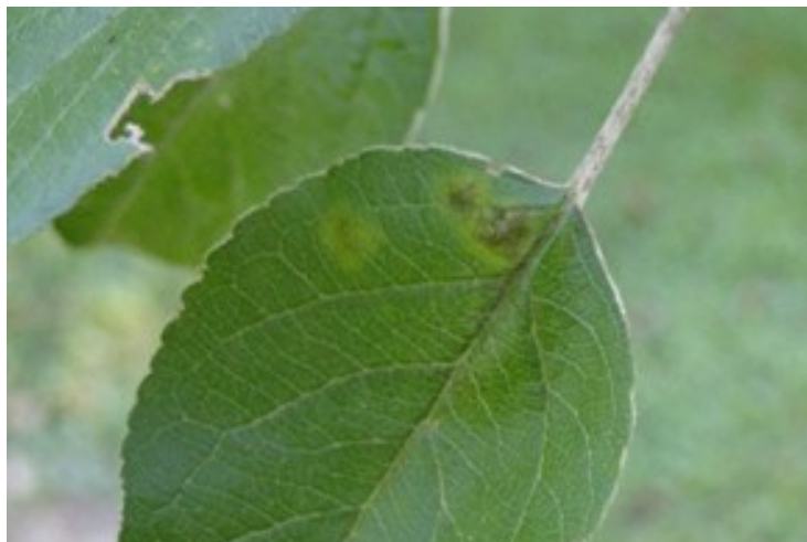
Figure 1. Scab lesions initially have indefinite, feathery margins.

Apple scab is the most consistently serious disease of homegrown apple and flowering crabapple in Kentucky. The most noticeable losses on apple result from reduced fruit quality and from premature drop of infected fruit. Scab also causes a general weakening of the host when leaves are shed prematurely. Summer defoliation of flowering crabapple due to scab invariably results in fewer flowers the next spring. Resistant cultivars and fungicides are available; however, sanitation is a critical step in prevention and management.