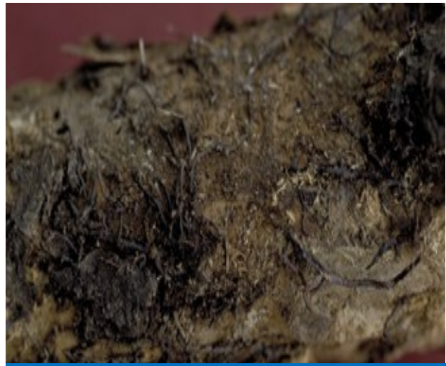
Figure 1. Dark brown rhizomorphs (or shoestrings) may be observed under the bark of trees infected with Armillaria root rot.

University of Kentucky Plant Pathology Extension Publications ( Website )