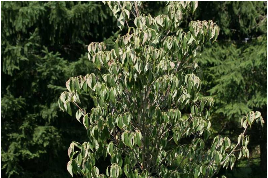
Dogwood showing water stress.

feasible, target irrigate with drip tape as it uses less water and there is little to no off targeted water loss. Make sure to monitor drip tape for clogs and breaks. When using overhead irrigation monitor coverage, be aware of wind direction and speed. Check nursery blocks to make sure that areas being irrigated are getting adequate coverage.