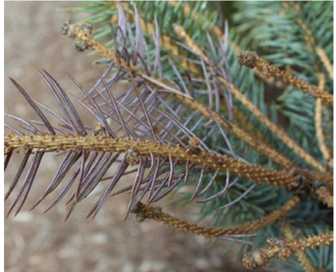
Figure 1. Needles infected with Rhizosphaera turn purplish brown during summer.