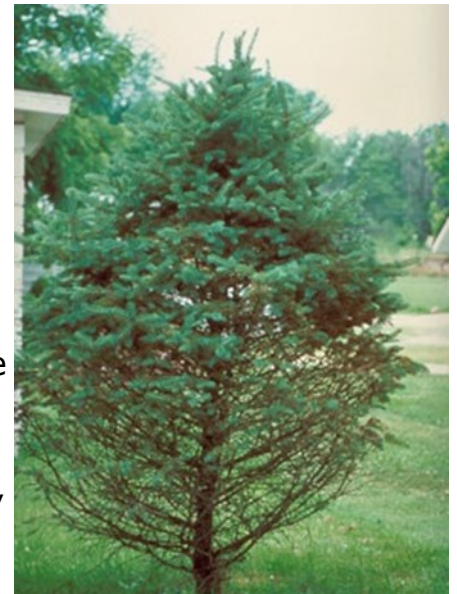
Figure 3. Needle drop and thinning of lower canopy are classic symptoms of Rhizosphaera needle cast in spruce.