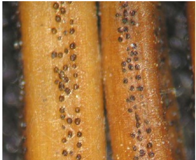
Figure 3. Rhizosphaera pycnidia appear as tiny raised, grayish bumps topped with white waxy caps.