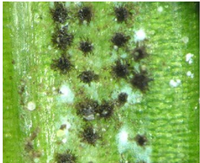
Figure 4. Tiny, brown to black, brush-like tufts emerge from infected needles through Stigmata infected stomata.