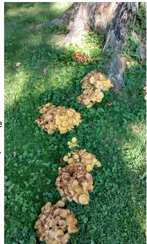
Figure 2: “Honey” mushrooms may be present at the base of infected trees or along decaying roots, especially during rainy seasons