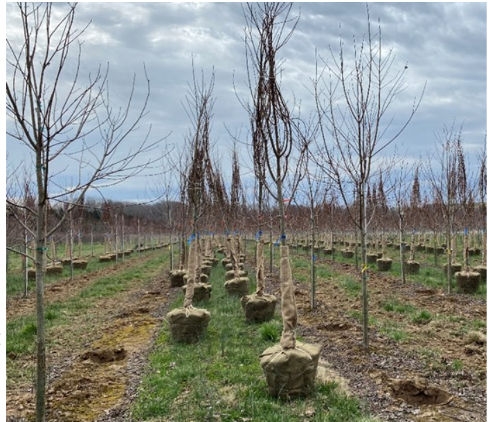
Valley Hill Nursery

Spring is busy, stressful, and seems never ending. The take-away from this, do not overlook the importance of the Spring application of PRE.