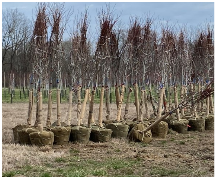
Valley Hill Nursery