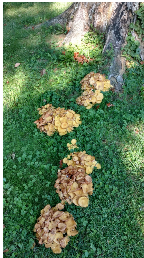
Figure 2. "Honey" mushrooms may be present at base of infected trees or along decaying roots, especially during rainy seasons.