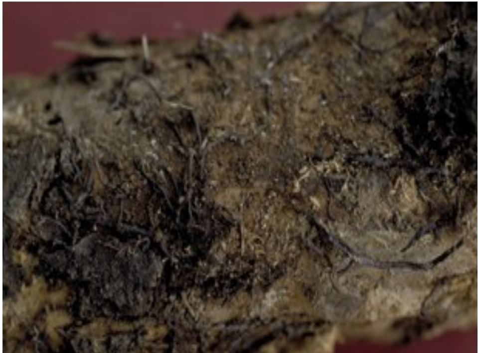
Figure 1. Dark brown rhizomorphs (or shoestrings) may be observed under the bark of trees infected with Armillaria root rot.