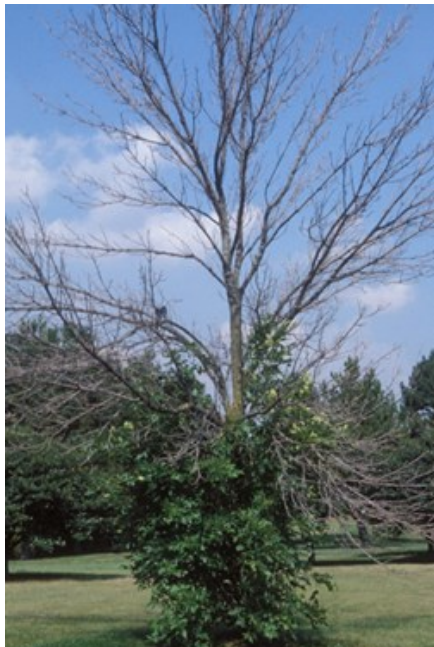
Figure 2. Water sprouts or suckers may result from severe stress.

Typically, one or more primary stresses cause deterioration of plant health, followed