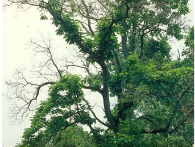
Figure 1. Dieback is a common symptom of stress

Woody trees and shrubs may exhibit decline resulting from the stresses that may occur during their lives. Stress may be the result of improper plant or site selection, incorrect planting or maintenance practices, or poor soil conditions. Injury from physical practices, weather, or chemicals can also lead to stress and decline. In addition, biological stresses such as diseases, insects, and wildlife could result in stress and decline of