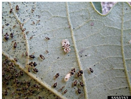
Figure 1) Adult lace bugs have a distinctive doily-like appearance while immatures are dark in color with small spikes. Lace bugs create speckling as they feed and they also leave behind black, motor oil like, frass as seen in the upper right of the image.

Lace bugs are true bugs, and they feed using their needle-like mouthpart to suck juices from the leaves of plants. One species, the oak lace bug, feeds specifically on oak leaves. Our colleagues with the Kentucky Division of Forestry have noted that in 2021, we have seen high numbers of these insects and noticeable damage to oaks across the state. Oak lace bugs are beautiful looking insects as adults, they resemble lace doilies that just happen to have six legs. As they feed, they cause stippling to the leaf. With enough feeding activity, the whole leaf may eventually become bronzed. They also have distinctive feces, their frass looks like black motor oil has been splattered on the leaf's surface.