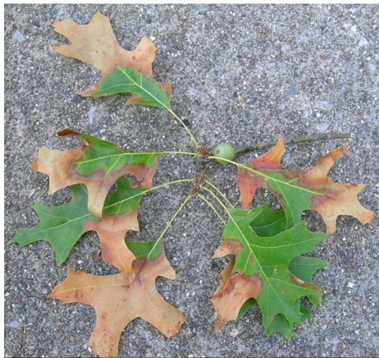
Figure 1) Premature leaf browning of a pin oak tree branch infected with bacterial leaf scorch.

European beech Kentucky coffeetree Shagbark hickory Common sassafras Tuliptree