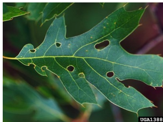
Figure 2) Oak shothole leafminer can create two kinds of distinct damage, one being a blotch like leaf mine produced by the larvae. The other is the almost symmetrical holes left behind by females. They pierce young buds and as the leaf expands, these holes expand and become apparent.

Leafminers are usually small insects that as immatures, will live and feed between the top and bottom layers of a leaf. Oaks can host several species of leafminer but one is more noticeable than others, the oak shothole leafminer. These leaf mining flies, spend their maggot stage in leaves feeding, their activity creates a blotch mine that can be mistaken for anthracnose. The mines are most obvious in May. However, as adults, they create damage that can be seen throughout the season. The females of these small flies will stab at new leaves and then drink the sap that is produced by this damage. As the leaf grows, these punctures will also expand creating a Swiss cheese like appearance. This can be seen from summer to fall.