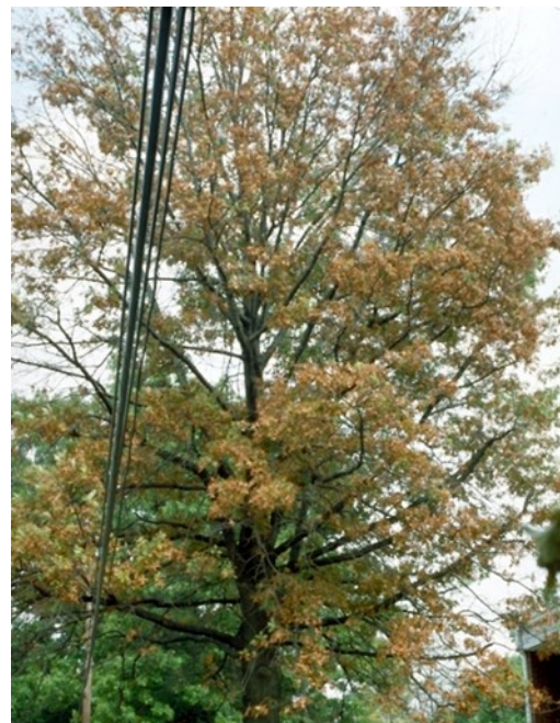
Figure 2) Pin oak tree that has turned entirely brown prematurely from many years of bacterial leaf scorch infection.