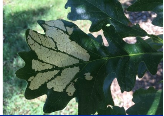
Figure 3) Oak leaf skeletonizers create thin, papery, oak leaves that are almost translucent. The immature form of this pest has fed on all layers of the leaf except for the top creating their distinctive symptoms.

These small caterpillars can be hard to notice, but their damage is hard to miss. Reaching only about a quarter inch in length before they pupate, the caterpillar is also pale yellow-green. As they develop, they also produce silken pods that they will hide in as they molt. The caterpillars will feed on leaves until there is only the upper layer of leaf left. This makes paper thin, brown leaves or brown patches. There are two generations, one in April and May and one that develops between August and the end of September.