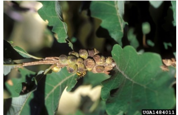
Figure 4) Oak bullet galls are usually green, brown, and in some cases slightly red. They can be easy to miss as they appear outwardly like a natural part of the plant's anatomy. They do drip honeydew though, which recruits other insects to the tree.

Oaks can be home to many different species of galls, including apple galls, jumping galls, horned oak galls, and midrib galls. Most galls are mere curiosities, they tend to pose little to no hazard to a tree. Insects that live in galls have adapted to trick trees into providing them a free house that protects them and provides them food. This is done with secretions from the mother insect or from the saliva of immatures causing the plant to form a tumor like growth around them. The bullet gall is no different. The wasp that induces these galls have a complex life cycle, but in the fall many noticeable round to acorn shaped galls can be found on oak. Inside, an immature wasp is feeding and developing. As they feed, they excrete out honeydew, a sugary fecal material that other insects love to devour. Yellowjackets, paper wasps, bees, ants, and many other hungry insects will visit galls to drink up. These congregations of stinging insects are often what people notice before they find the galls.