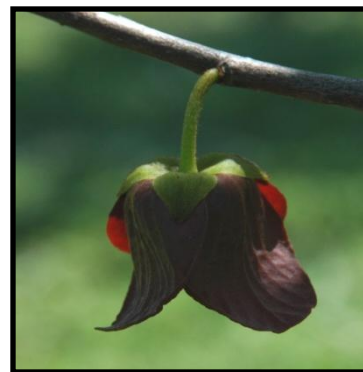
Asimina triloba Paw Paw

Asimina triloba – Paw Paw is a Kentucky native small tree known for its custardy fruit. It is at home in moist environments and is excellent food for the larvae of butterflies. The purple-brown flowers are attractive. Fall color is variable from a green-yellow to a bright yellow.