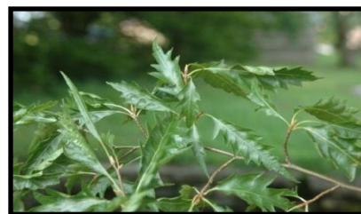
Fagus sylvatica 'Laciniata' or 'Asplenifolia'

Fagus sylvatica 'Laciniata' or 'Asplenifolia' (Cut Leaf European Beech) are beautiful trees with finely dissected foliage, smooth gray bark and a nice habit. These cultivars match the species at 50 - 60 feet tall with a width of 35 - 45 feet. Propagation is by grafting to Fagus sylvatica seedlings. Difficult to find, but worth the effort.