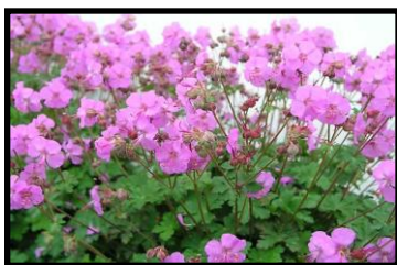
Geranium x cantabrigiense 'Karmina'

Geranium x cantabrigiense 'Karmina' is a 6-12" high ground cover geranium considered "rhizomatous". The flowers are red to lavender and it is propagated by division of the rhizome or by seed.