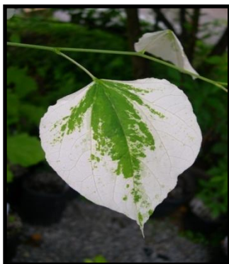
Cercis canadensis 'Silver Cloud'

Cercis canadensis 'Silver Cloud' is an outstanding Theodore Klein selection. The white on green foliage is striking and holds up reasonably well through the summer. It's tolerance of soils and heat is matched by its hardiness, having survived the -24 F of several Kentucky winters. Because of the continuing interest in this plant that was once impossible to find, it is now readily available.