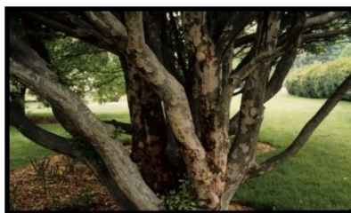
Parrotia persica Persian Parrotia

Parrotia persica (Persian Parrotia) is a member of the witchhazel family (Hamamelidaceae). The small to medium tree is 20-40 feet tall with a 15-30 foot spread with exfoliating gray and off-white bark. The flowers without petals are "inconspicuous" but for the red stamens. The foliage is medium textured. Fall color is mixed; red, orange, yellow, and variations of each. It is propagated by seed or cuttings taken in June-July treated with KIBA and rooted under mist.