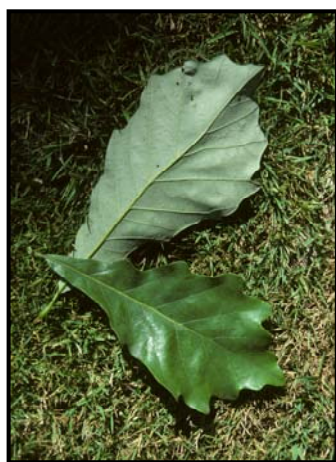
Quercus bicolor Swamp White Oak

is a stunning new selection of our native redbud. This 20-25' tall tree absolutely explodes with brilliant fuchsia pink flowers in Spring; a much brighter shade than the typical redbud. Most at home in sun to dappled shade, 'Appalachian Red' will adapt to any average garden soil. Specimens can be seen at Yew Dell Gardens, Seneca Park, Bowman Airfield, and Whitehall House and Gardens. Best in USDA cold hardiness zones 5-8.