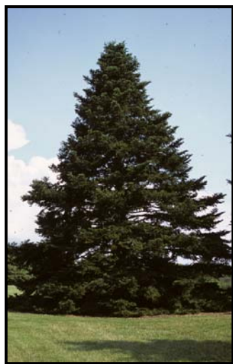
Abies nordmanniana Nordmann Fir

Promoting New and Superior Plants for Kentucky Landscapes