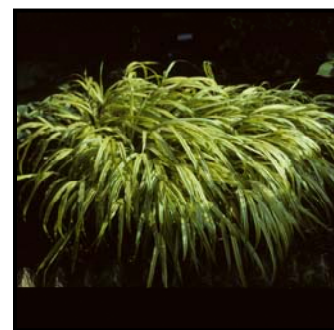
Hakonechloa macra 'Aureola' Golden Japanese Forest Grass

makes an outstanding bright accent in the lightly shaded garden. Growing slowly to 1' high and 3' wide, the elegantly arching blades are striped in brilliant green and gold tones. This exceptional ornamental grass performs best in a moist soil. Plants can be seen in the walled garden at Yew Dell Gardens. It is most at home in USDA cold hardiness zones 5-9.