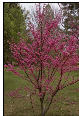
Cercis canadensis 'Appalachian Red'

is a stunning new selection of our native redbud. This 20-25' tall tree absolutely explodes with brilliant fuchsia pink flowers in Spring; a much brighter shade than the typical redbud. Most at home in sun to dappled shade, 'Appalachian Red' will adapt to any average garden soil. Specimens can be seen at Yew Dell Gardens, Seneca Park, Bowman Airfield, and Whitehall House and Gardens. Best in USDA cold hardiness zones 5-8.