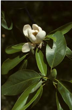
Magnolia virginiana var. australis (Evergreen Sweetbay Magnolia)

This evergreen variety of an old Kentucky favorite makes an excellent garden plant. Plants will grow 20-30' tall with upright outline and dark, thick glossy green leaves with white undersides. Two-inch-wide, lemon-scented creamy flowers grace the plant in late spring and sporadically through the summer. An excellent choice for full sun or part shade in any reasonable soil.