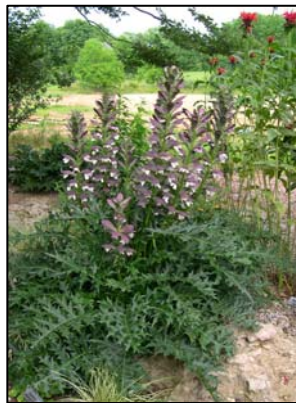
Acanthus spinosus (Bear's Breeches)

is a herbaceous perennial prized for exceptional foliage, unique flowers and tremendous adaptability. Happy in full sun or part shade, this tough plant offers glossy dark green spiny foliage in a mass up to about 24". The unique late spring flowers of white, purple and mauve are produced on tall husky spikes that extend a foot or more about the foliage.