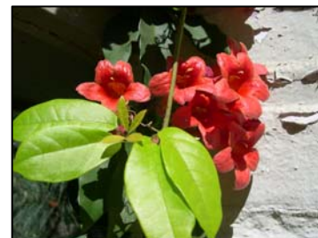
Bignonia capreolata (Cross Vine)

This Southeast native woody vine is an excellent choice for full sun or part shade. Semi-evergreen foliage of dark leathery green provides the perfect foil for brilliant orange (occasionally scarlet) trumpet blooms in late spring. Blooms range from yellow-orange ('Tangerine Beauty') to bright red ('Atrosanguinea'). This clinging vine is excellent for rock walls or arbors and is highly pest resistant.