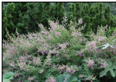
Lespedeza thunbergii 'Gibraltar'

Gibraltar Bush Clover has dark green foliage and fine pink-purple pea shaped flowers in long arching racemes 6 inches long. It blooms August through September.