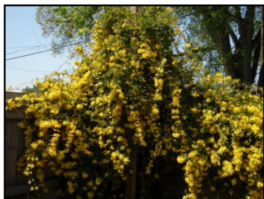
Gelsemium sempervirens 'Margarita'

Margarita Carolina Jasmine is the cold hardy form of Carolina Jasmine, an evergreen vine. Prefers well-drained, high organic matter, acid soils. The early spring yellow flowers are fragrant, showy, and visible from a distance. It can be grown as a ground cover or a climber.