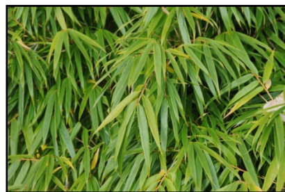
Fargesia rufa Green Panda™

Green Panda bamboo has a clumping root system. Six feet tall when mature; it is vigorous and develops many new culms each season. Siting should provide protection from the hot afternoon sun.