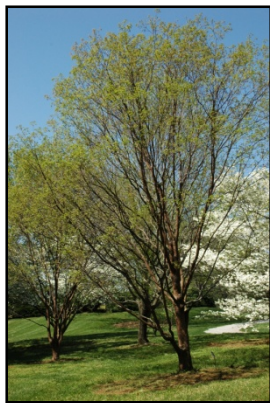
Acer griseum x maximowiczianum ( A. nikoense ) 'Girard's'

Girard's Maple is a hybrid of A. griseum and A. maximowiczianum . It is appreciated for its flaking ("cat scratched") bark, trifoliate bluish green leaves and orange-red fall color. Girard's maple shows more vigor and faster growth than A. griseum .